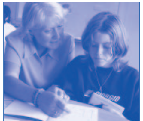
"An effective Christian presence? St Michael's Youth Project which was born from St Michael's Parish Church to support Children and Young People, as featured in Angels and Advocates (see publications feature overleaf)."

Look out for more information in future editions of Spirit Level , or contact CRC for more information.