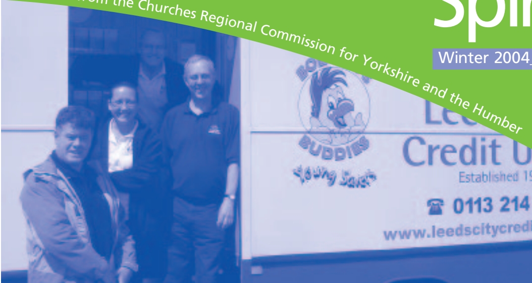
The Leeds City Credit Union Mobile Unit brings advice and affordable loans and savings services out into the community