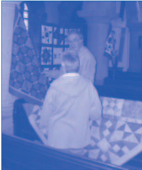
Visitors on the Towers, Tours and Treasures trail admire locally crafted quilts at St Hilda's Church at Egton.

Timed to coincide with both the Civic Trust's national Heritage Open Days event and the Yorkshire Historic Churches Trust annual sponsored cycle ride, Towers, Tours and Treasures was billed as "A weekend of events and entertainment in North Yorkshire's churches".