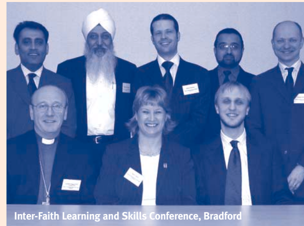
Inter-Faith Learning and Skills Conference, Bradford