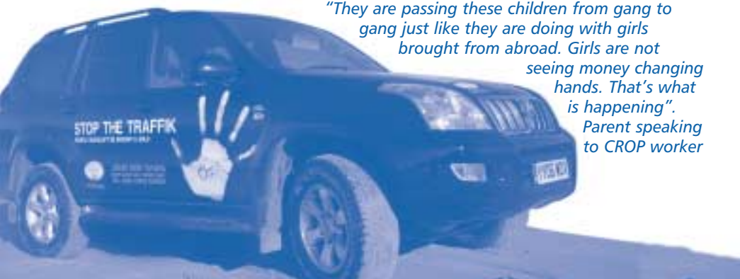
The Hull Freedom Trail campaign which aims to send vehicles as humanitarian aid to Sierra Leone will join the CRC convention (see page 3 and visit www.hullfreedomtrail.com to find out more).

"They are passing these children from gang to gang just like they are doing with girls brought from abroad. Girls are not seeing money changing hands. That's what is happening". Parent speaking to CROP worker